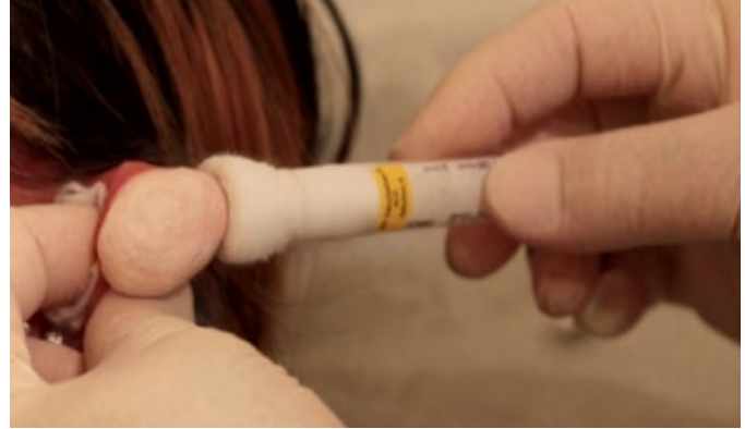
Figure 2. Custom made large cotton swab being used during the application of cryotherapy to a large ear keloid. The frozen keloid appears white.

Once all preparations are made and the keloid is ready for cryotherapy, the swab is dipped in liquid nitrogen and brought in contact with the keloid. The swab is gently pushed against the keloid and is held in place until the lesion starts to freeze. The frozen keloid tissue will appear white in color (Figure 2).