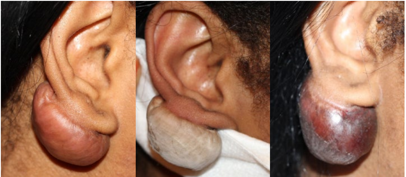
Figure 6. Right ear keloid before (left), immediately after (center) and five days after the application of cryotherapy (right). Notice that the keloid is undergoing necrosis and the overlying skin is starting to form a thin dark layer.

The cryotherapy-induced blister behaves very similarly to a burn-induced blister and will sooner or later disintegrate. The exudative fluid that leaks from the blister is serous or serosanguinous. The oozing and leakage of the exudative fluid continues for about a week, at which point the keloid tissue starts to contract to its pre-treatment size. A dark color scab starts forming on the surface of the treated keloid (Figure 6). The scab gradually thickens (Figures 7-8) yet remains in place for several weeks before it fully separates from the underlying tissue.