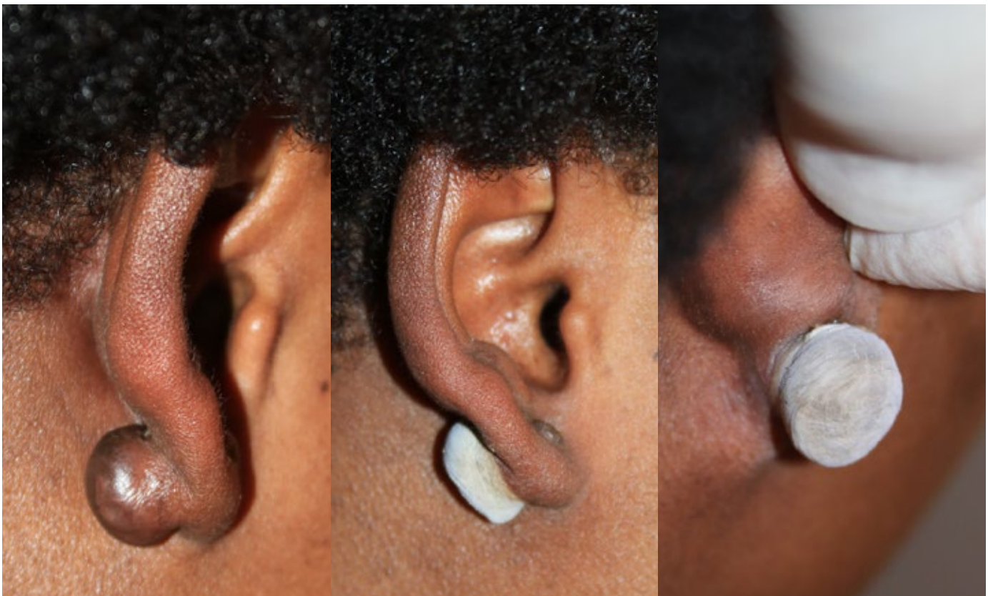
Figure 3. Earlobe keloid, before (left) and after application of cryotherapy (middle and right). The frozen keloid tissue appears white in color. In most cases, this size keloid can be treated without local anesthesia.

It is common sense that smaller keloids will freeze faster and will require fewer applications of liquid nitrogen. Larger keloids will obviously need a greater number of applications of liquid nitrogen in order to be properly and adequately frozen.