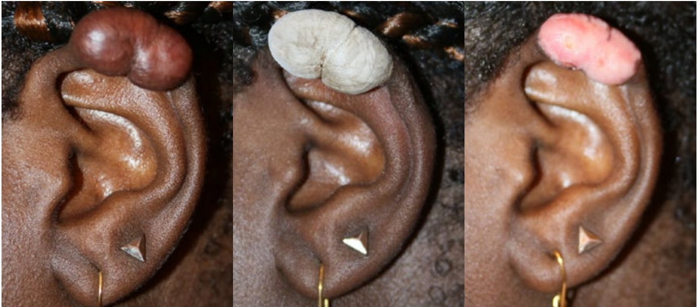
Figure 9. Ear keloid before (left) immediately after (center) and 41 days after application of cryotherapy (right). Note that the scab has already fallen off and there is lack of pigment at the treatment site. Also note the reduction in the mass of keloid after recovery from the first treatment. The necrosis and recovery cycle is now complete, and the patient is ready to receive the next course of cryotherapy.