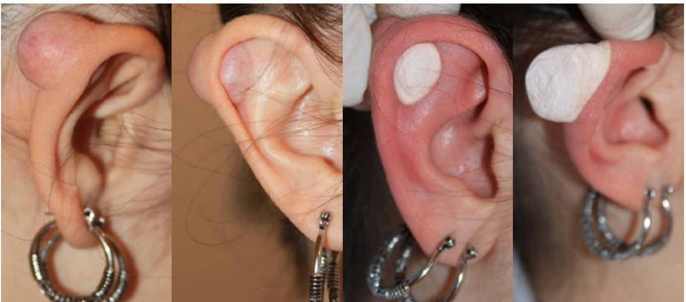
Figure 10. Ear keloid before and immediately after application of cryotherapy to both anterior and posterior segments of the keloid (Day 0).

Cryotherapy is an effective and safe method for treating bulky keloids. When performed correctly, significant debulking can be achieved, even with one cycle of cryotherapy (Figure 11). It is important to note that cryotherapy may not be a curative treatment for keloid disorder, but it is a safe method to reduce the mass of keloids and provide symptom relief and comfort to the patients.