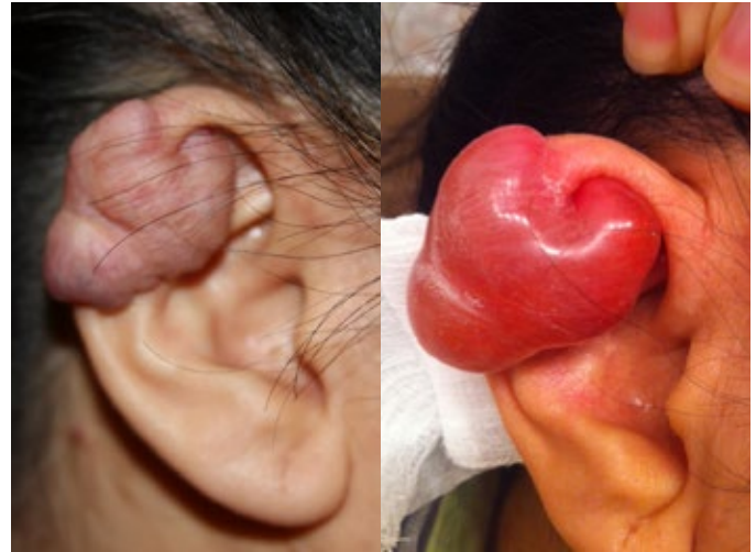
Figure 5. Complex ear keloid before (left) and one hour after application of cryotherapy (right). The frozen keloid thaws within several minutes after cryotherapy. Soon after the treated keloid becomes edematous and forms a blister. Notice that the tissue around the blister appears totally normal.

Within the first few hours of application of cryotherapy, the treated keloid tissue becomes edematous and swollen (Figure 5). The treated area should be bandaged. Patient education about the aftercare should take place prior to initiation of therapy. Patients should be instructed to remove and replace the bandage at least once a day, or as soon as they notice staining of the gauze. It is important to keep the bandage as clean and as dry as possible at all times.