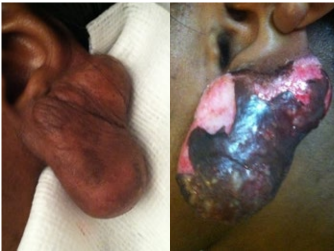
Figure 7. Complex ear keloid before (left) and 10 days after application of cryotherapy (right). Notice that the keloid tissue is undergoing necrosis and the disintegrated skin is starting to transform into a dried scab.

The cryotherapy-induced blister behaves very similarly to a burn-induced blister and will sooner or later disintegrate. The exudative fluid that leaks from the blister is serous or serosanguinous. The oozing and leakage of the exudative fluid continues for about a week, at which point the keloid tissue starts to contract to its pre-treatment size. A dark color scab starts forming on the surface of the treated keloid (Figure 6). The scab gradually thickens (Figures 7-8) yet remains in place for several weeks before it fully separates from the underlying tissue.