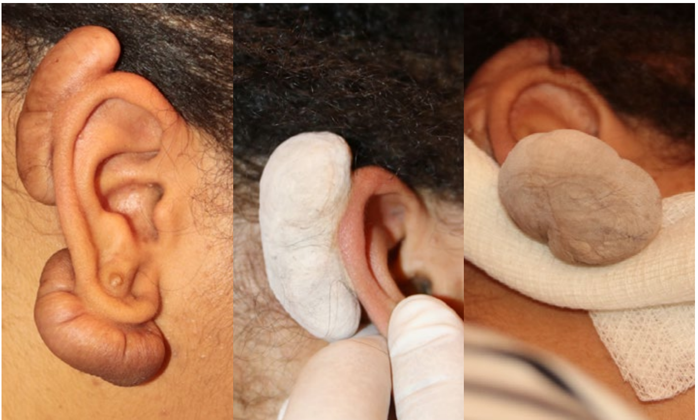
Figure 4. Semi-massive ear keloids before (left) and immediately after application of cryotherapy (middle and right). Treating a keloid this size should best be done under local anesthesia using liposomal bupivacaine or other similar long-acting local anesthetics.