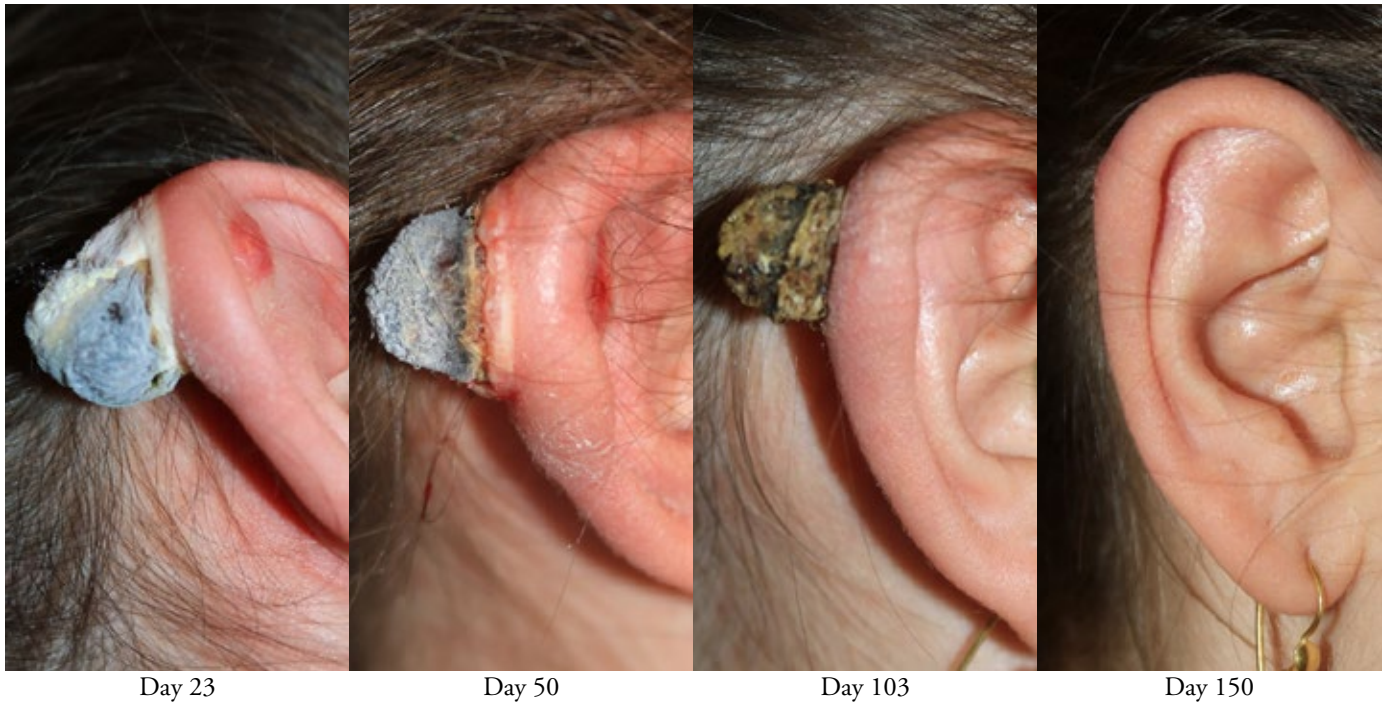
Figure 11. Ear keloid immediately after application of the 2 nd cryotherapy on Day 23 with the scab in place; after 3 rd cryotherapy on Day 50 still with the scab in place; Day 103 after the first treatment still with the original scab in place. The furthest right image depicts the ear on Day 150. Notice that the scab has finally fallen off and the ear shows significant improvement. The patient continued to receive more treatment for the remnant of the keloid behind her ear (not visible in this image).