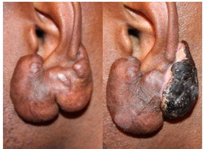
Figure 8. Complex ear keloid before (left) and 24 days after application of cryotherapy (right). Notice the formation of the thick black scab over the segment that was treated with cryotherapy.

The duration of the necrosis and recovery cycle depends on the size of the treated keloid and varies from patient to patient. Keloids that measure less than one centimeter in diameter will go through this cycle in about 3-4 weeks. The cycles take longer for larger keloids, lasting about 8-12 weeks for very large lesions.